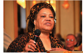
Members voicing their concerns to legislators